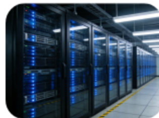
Environmental and Power Monitoring