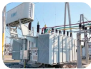
Remote meter reading